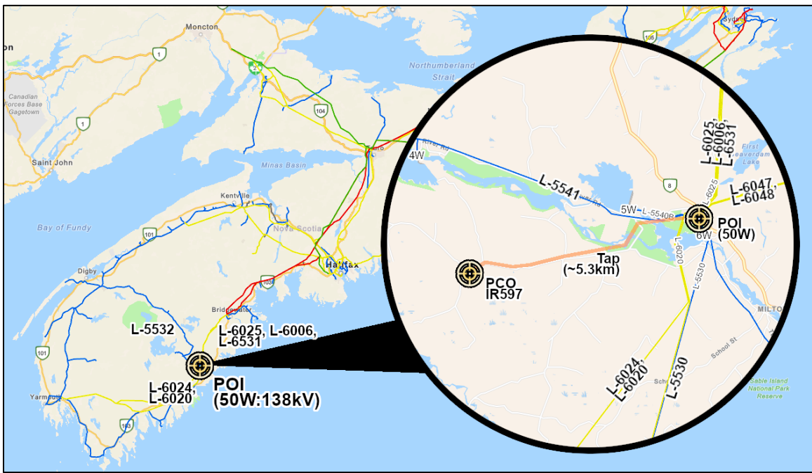
Figure 1: IR597 approximate geographic location

The Interconnection Customer (IC) identified a 138 kV bus at 50W-Milton as the Point Of Interconnection (POI). This wind generation facility will be interconnected to the POI via a 5.3 km long 138 kV transmission line from the Point of Change of Ownership (PCO). Figure 1 shows the approximate location of the proposed IR597 site.